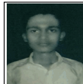
- AsfaKulla Shikari